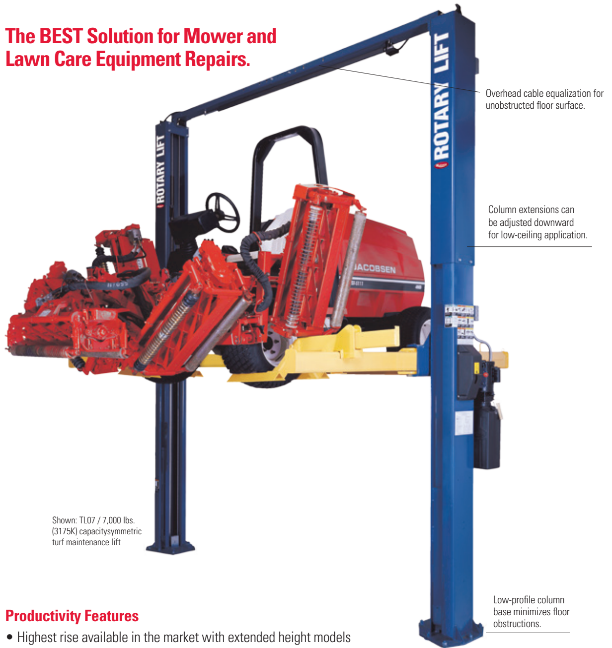
Shown: TL07 / 7,000 lbs. (3175K) capacity symmetric turf maintenance lift

The BEST Solution for Mower and Lawn Care Equipment Repairs.